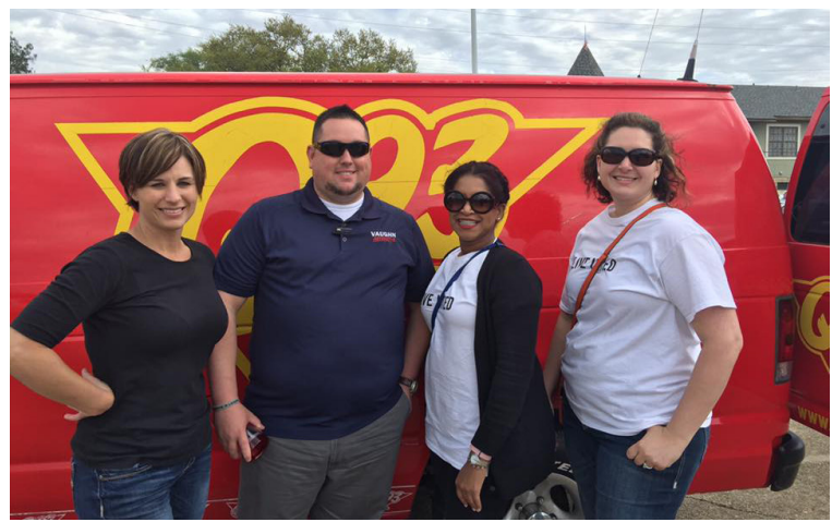
Live Remote at Vaughn Automotive. Q93 was our media sponsor for our Give Us A Hand campaign. Some of our board members stopped by to show support for the campaign.

Thanks to Vaughn Automotive for being our matching sponsor for our first ever "Give Us A Hand, Cenla" campaign during the month of April. This campaign aimed to give those individuals, who may not have the opportunity through a workplace campaign, the opportunity to donate to United Way.